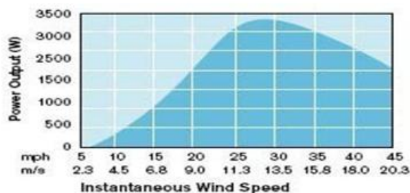
Power output vs wind speed