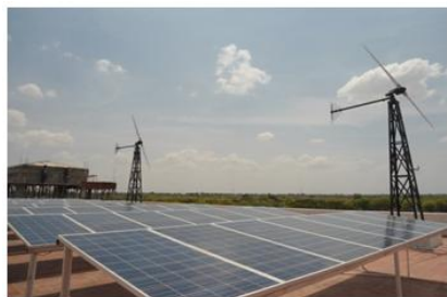
Fig1.over all hybrid system