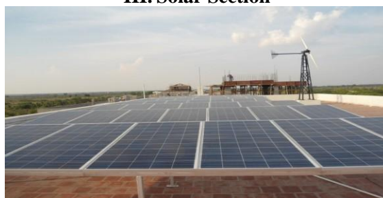
Fig 3.view of solar section