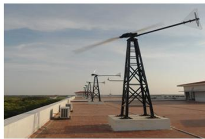
Fig 2.view of wind section